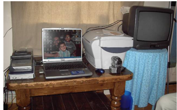
Figure 1. A participant's home video editing suite.

perceptions of the editing process in general. From being shown examples of home videos, discussion naturally moved on to cover what happened with the participants' movies once they had been created, including how they had been archived and stored. In many instances, an exploration of how the resultant video archive was stored within the home helped to elucidate participants' perceptions of their video archive, especially in relation to their home video consumption and sharing behaviours. After discussing what constituted the activities making up the common lifecycle of a video project, from conception to final ‘product’, the participants were asked about perceptions of various suggested advances in video technology to further discuss their motivations in creating home movies.